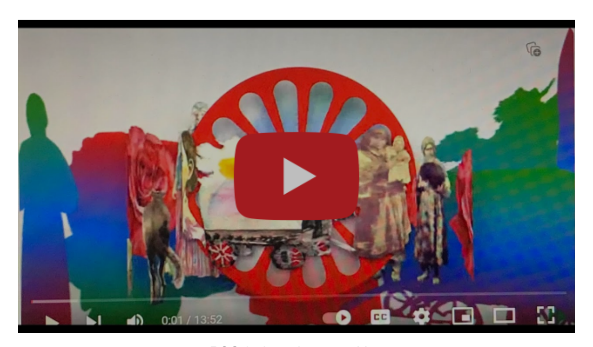
RSG 25th anniversary video

We've also made the video below about our work and achievements, that features staff, community members and archive footage.