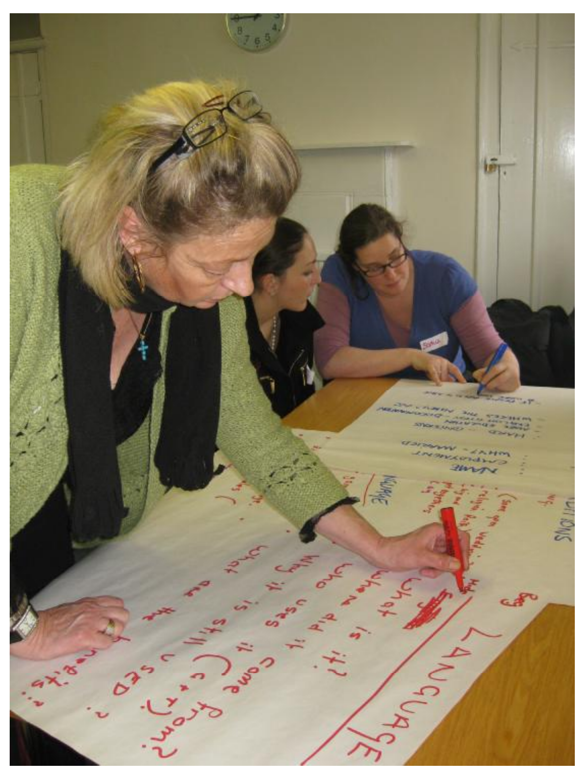
Photo 3. Community members doing group work in Confident to Present training

A certificate was awarded to participants on completion of the training.