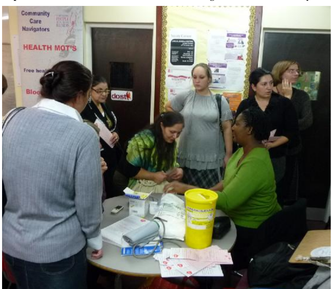
Impact of Health event to increase awareness amongst the Roma community

A Roma man attended with his family, including their young baby. The nurse realised that he was Roma and asked him outright if this was the case. She realised that he was probably unfamiliar with the UK childhood immunisation programme and spent time explaining it to him in much greater detail. As well as then immunising their baby she realised that their child of about 5 years had not had his pre-school booster and this was given also. The rapport was such that she was able to enquire about the child's schooling and then inform the man that the child was old enough to attend school and explain how he should proceed to enrol him. The family returned for the baby's second vaccination and expressed their gratitude to the nurse, explaining also that the child was now enrolled at a local school.