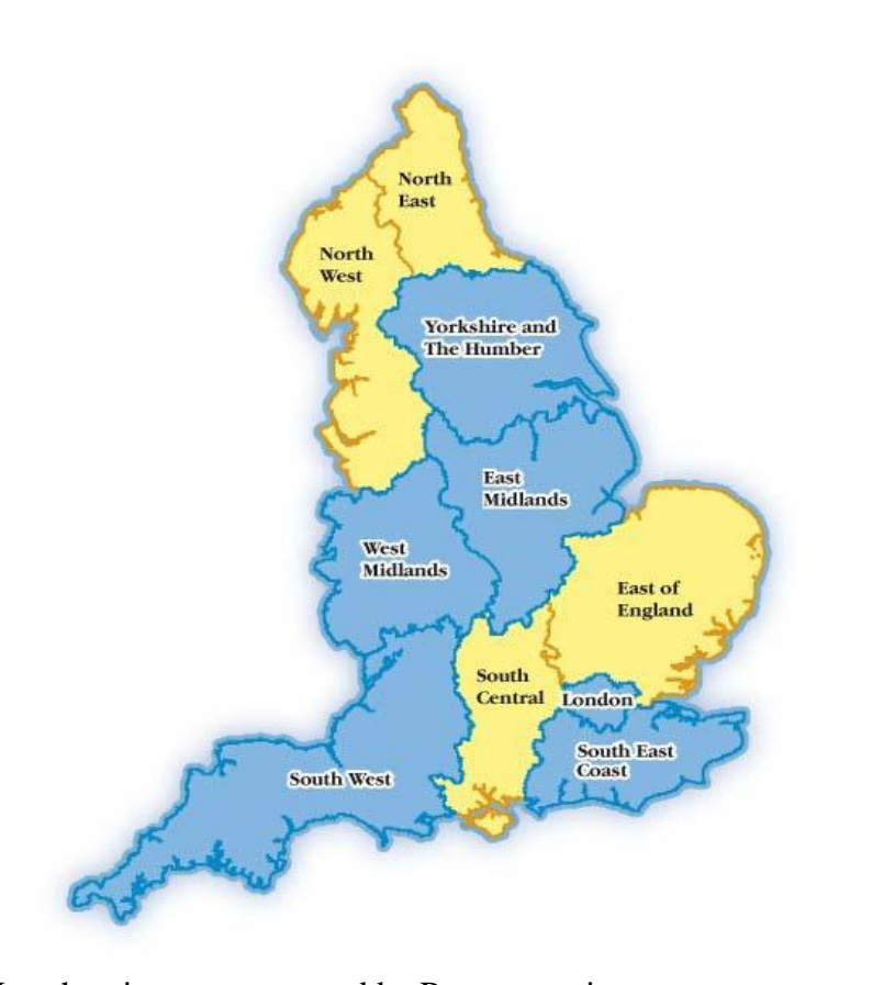
Figure 1 Map showing areas covered by Pacesetter sites