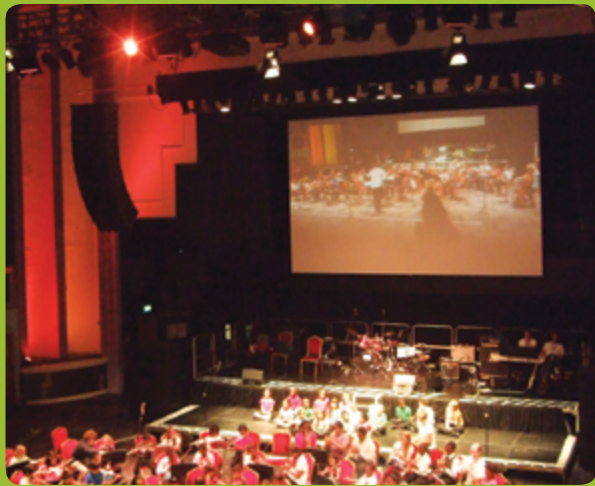
The Bridging Sounds Roma Youth Orchestra's performance, 2015