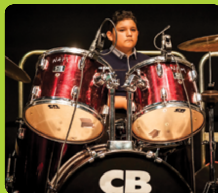
The Bridging Sounds Roma Youth Orchestra's performance, 2015