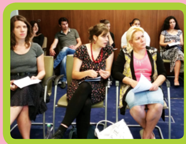
Community Training 2015

Last year, the Project made progress in achieving the following outcomes: