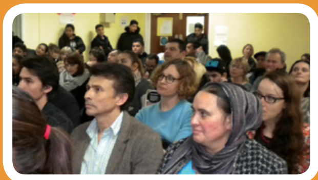
Community Training, 2014

Policy & Campaigning Project aims to improve the social inclusion of Roma refugees and migrants through their civic participation in decision making structures. The strength of this Project is in its community empowerment approach, as it gives Roma people a voice on matters that affect them on a local, national and European level.