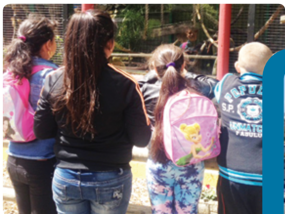
Children's outing, 2014/15