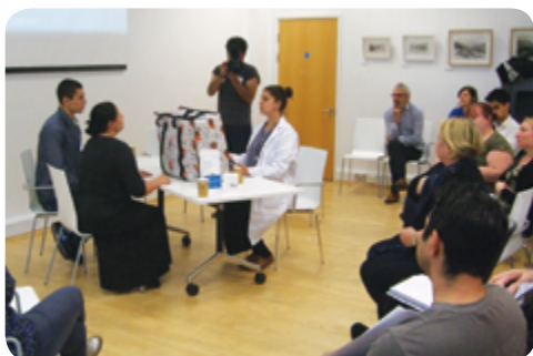
Forum Theatre, 2015

The Roma Community Advocacy Project aims to reduce the social exclusion of Roma refugees and migrants in London by empowering them to bring about change in their communities through a two-way approach: i) One-to-one advocacy; ii) Peer advocacy, including community training sessions; consultations with service providers and decision makers; focus group meetings and Forum Theatre.