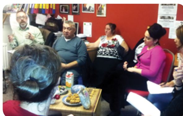
Consultation meeting, 2014