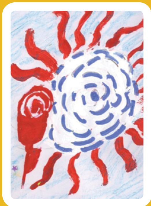
Drawing by Roma Child

We would like to take this opportunity to thank everybody who supported the work of the Roma Support Group during 2014 - 15 through grants and the donation of their valuable time.