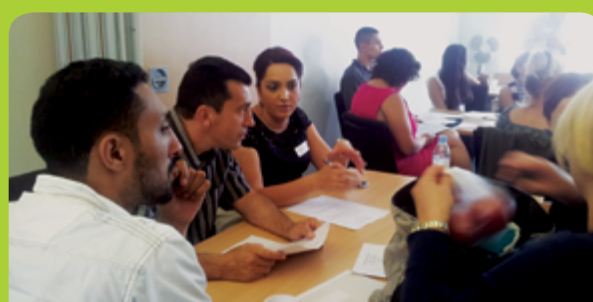
Roma Refugee &amp; Migrant Forum, 2014