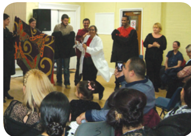
Forum Theatre, 2014

During the public performances, Roma beneficiaries were able to interact with the audience, which provided them with a powerful tool for exploring solutions to difficult problems that they face in everyday life.