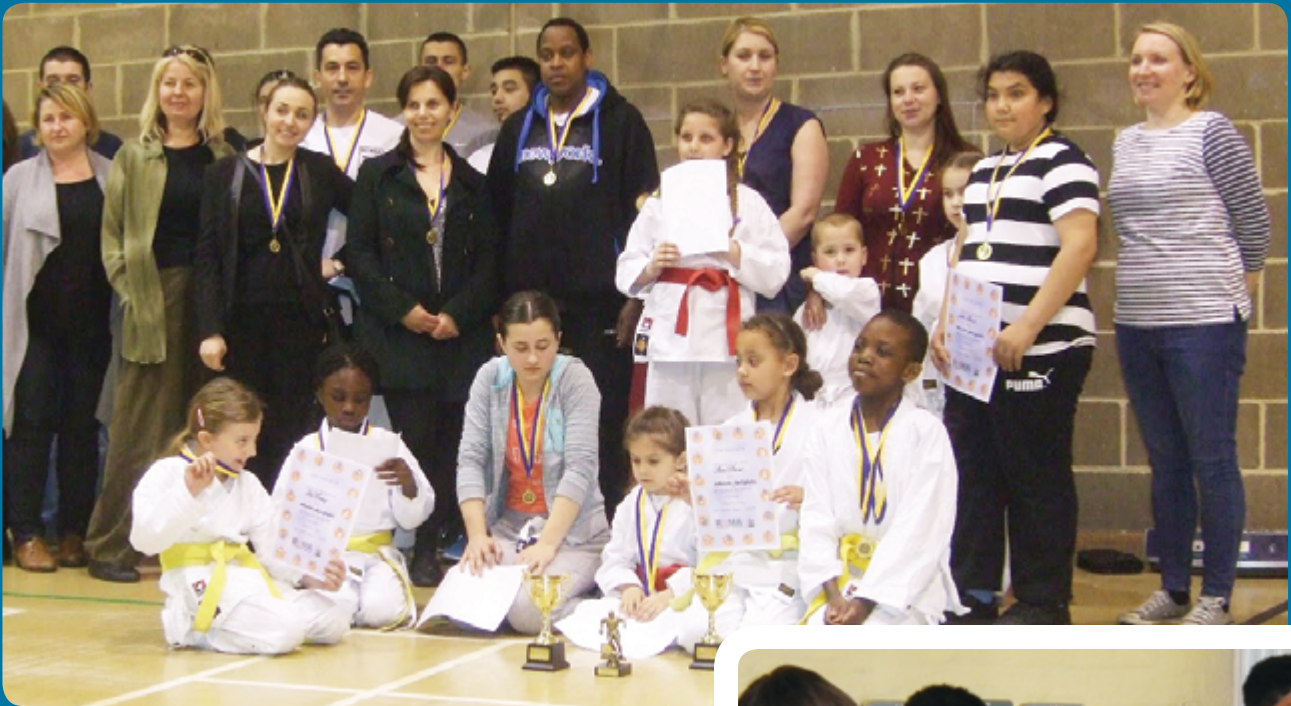
Sports Day, 2015

To harness young people's enthusiasm in sport, the Aspiration Project organised a Sport's Day, which gave them an opportunity to sample basketball, karate and team assault courses. The message of the event was "We are all winners!" and feedback from young people and their parents showed 100% satisfaction and enjoyment.