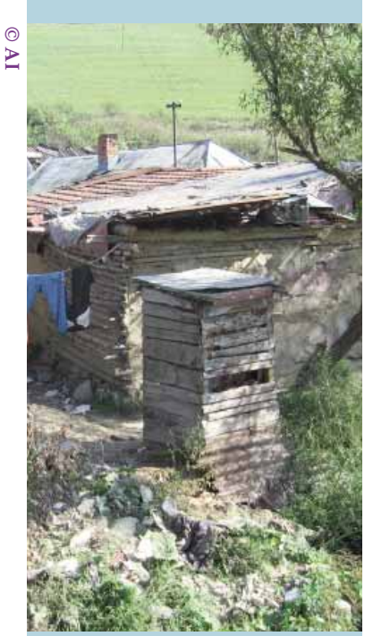
Outdoor latrine empties directly into river in Romani settlement.

not always ensured that these centres are open to Romani people. The community centre provided in the village of Letanovce appeared to be largely inaccessible, including as a place for children to do homework after school. In Markušovce settlement, there is a community centre with washing facilities and a learning area, but the washing machine was not working when Amnesty International visited in September 2006. The learning area had a single table and two chairs, and a room containing a ping-pong table had no other furniture at all.